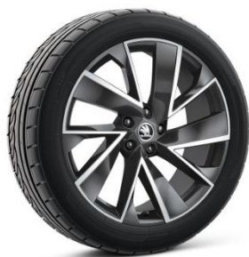
20" Vega alloy wheels