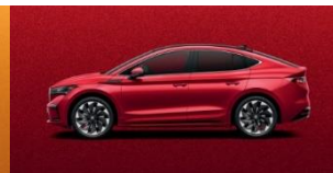
Velvet Red Metallic (+$1,000)