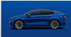
Energy Blue Solid