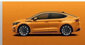
Phoenix Orange Metallic (+$1,000)