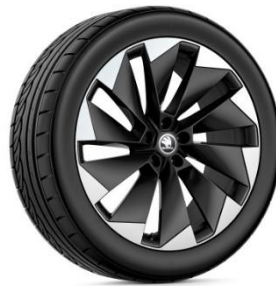
21" Supernova alloy wheels (+$1,500)

Škoda reserves the right to make changes to specifications, colours and prices without notice. Whilst we make every effort to ensure that specifications are accurate at the time of publication, you should always check with your Škoda dealer for the latest information.